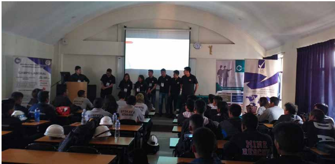
Figure 18: Mining Rescue Conference - XV CONEIMIN Piura - region