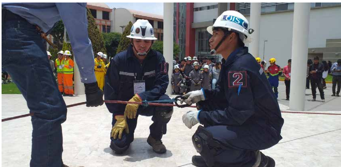
Figure 20: Mining Rescue Conference - XV CONEIMIN Piura - region