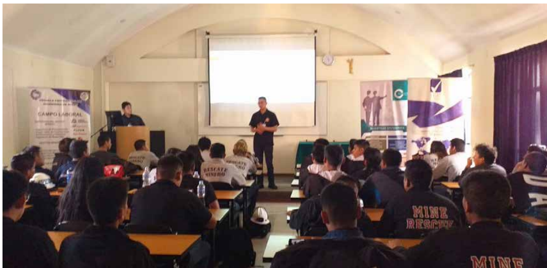
Figure 19: Mining Rescue Conference - XV CONEIMIN Cusco region