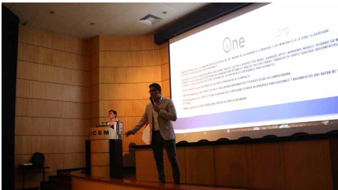
Figure14: Call SME - UCSM Presidenet Walter Aranda