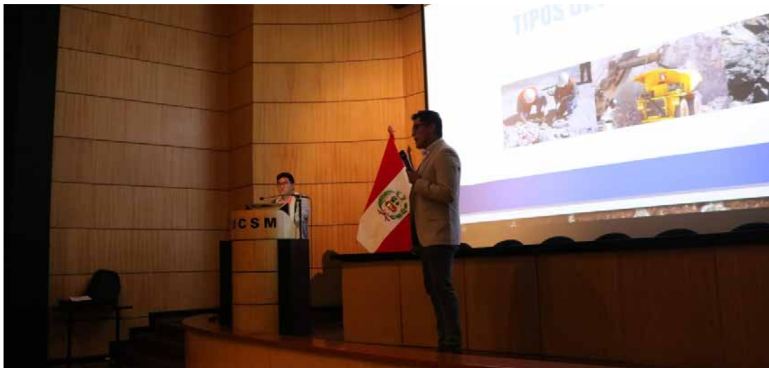
Figure13: Call SME - UCSM Ex Vicepresident 2018