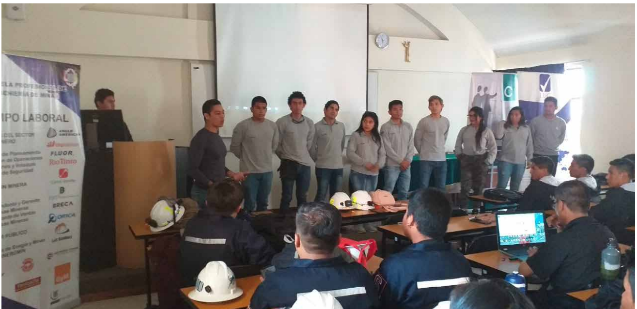
Figure 9: Mining Rescue Conference - XV CONEIMIN

The main objective of this conference was to unify the concept of security among all the participants and to delve into a more consistent objective, which is to safeguard the lives of others.