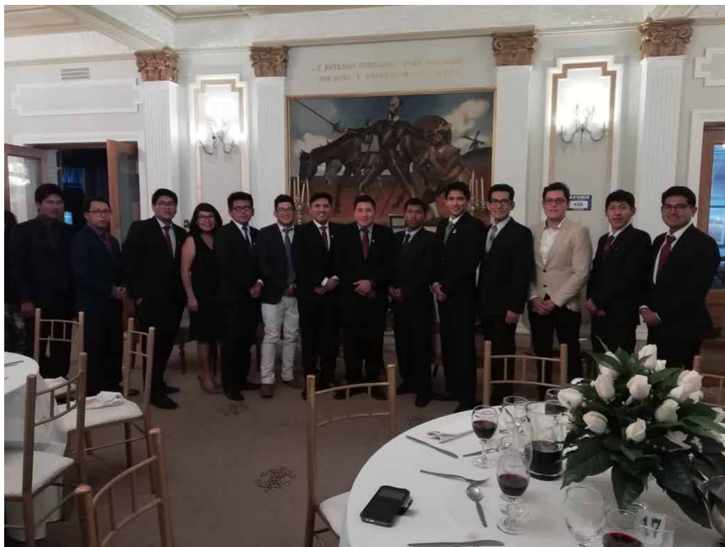
Figure 6: SME Planning Contest Award

In September 2019, SME was pleased to invite all the presidents of the SME student chapters nationwide to the third planning competition award, where the winning university was the National University of Engineering. This was done in the city of Arequipa.