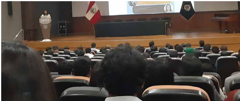
Figure 1: Monthly SME meetings - UCSM

The regularity of our meetings varied between 2-4 times a month, depending on the planned schedule and the activities that we had to carry out in the short term. The presentations in English were very beneficial for all the members, since unlike a traditional course, the participants had to expose on a technical topic of mining which added an extra difficulty since they had to have a very good previous preparation, that they included extensive readings on the specific technical subject and learning of various concepts related to the topic to improve our technical language.