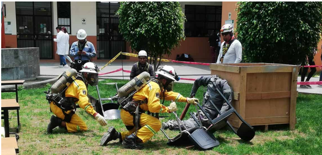
Figure 16: Mining Rescue Competition - XV CONEIMIN lightweight structures