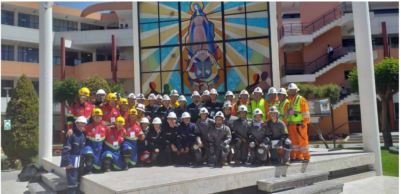
Figure 8: Mining Rescue Competition - XV CONEIMIN

Finally we had the National University of San Agustín de Arequipa as winner.