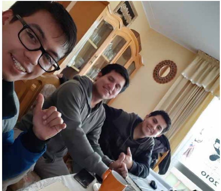
Figure 4: Planning Team - PERUMIN

In September 2019, the members of the SME Student Chapter UCSM participated in the design and planning contest within the framework of PERUMIN; where various Peruvian universities participated. They had an arduous preparation throughout the year and managed to learn various things including real teamwork. They maximized their abilities and gave their best.