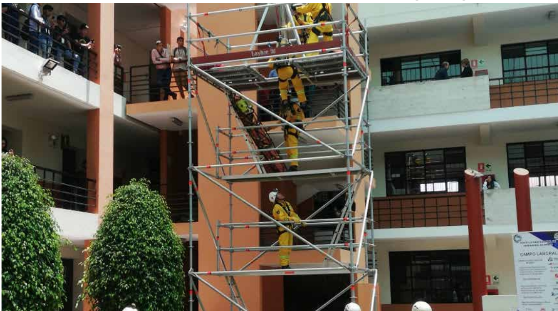
Figure 17: Mining Rescue Competition - XV CONEIMIN rescue in heights