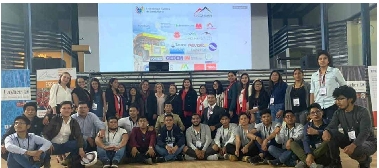
Figure 7: National meeting of student chapters

We were also pleased to receive the SME chapter student from Colombia belonging to UPTC University.