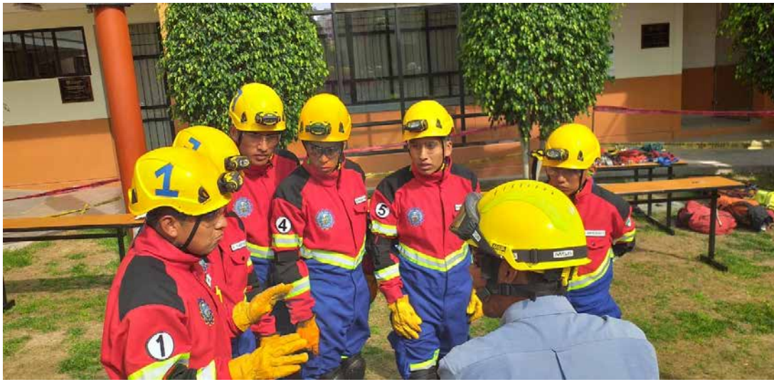
Figure 15: Mining Rescue Competition - XV CONEIMIN