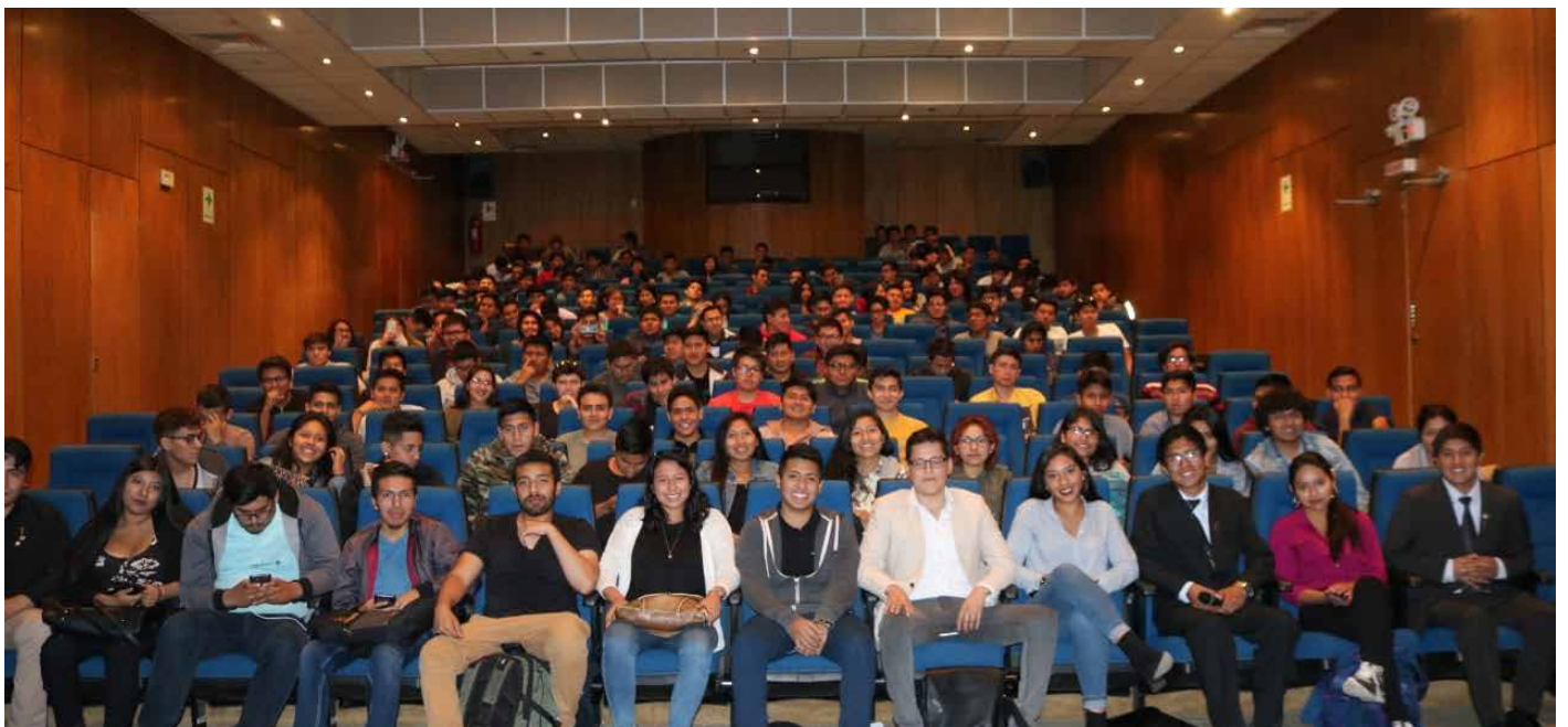
Figure 3: SME call - UCSM

The impact was very high and interest in students increased. This was our first activity of the year and we started it off on the right foot.